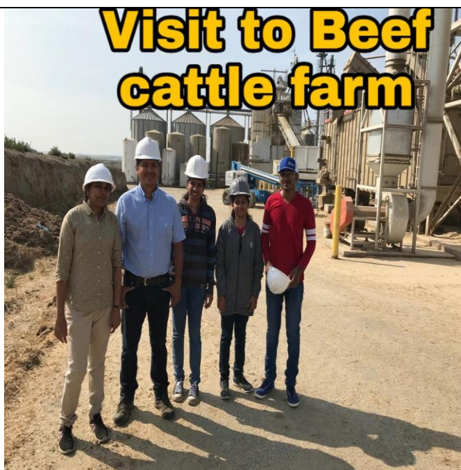
Visit to Beef cattle farm