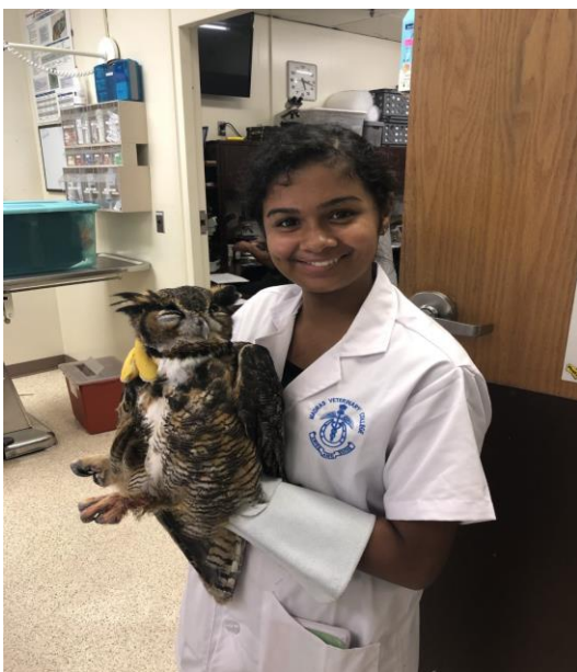
Handling a Great Horned Owl