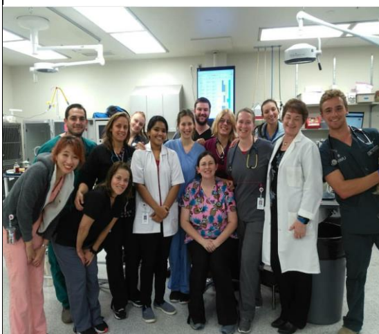
Myself with the faculties and fellow interns in WSU